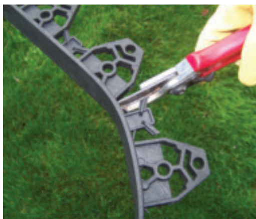
Easily converts to flexible with use of a pruner

Anchor stakes recommended and sold separately. Five anchor stakes recommended per 8' length.