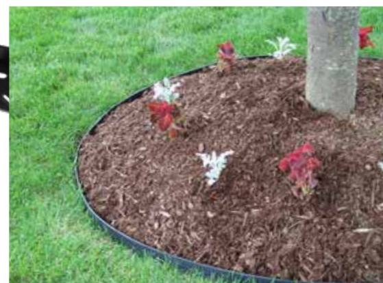
Use Around Trees

The foot design of our product allows for the use of other type of anchor stakes