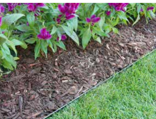
Edge Planting Beds

go to the website you ordered this product from and type in VALLEY VIEW 9" POLY NAILS in search bar.